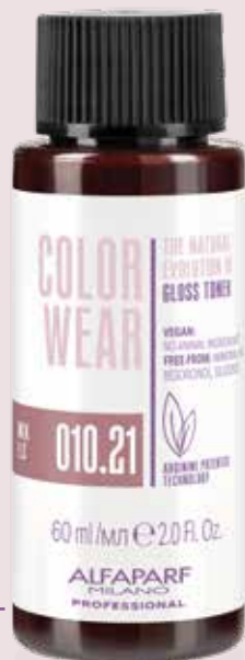
Bottle 60 ml

Thanks to its expertise in formulations, Alfaparf Milano Professional has achieved a formula that is both gentle on the hair and high-performance.