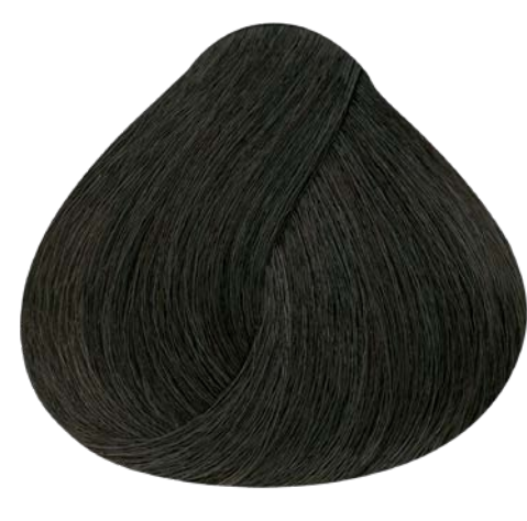
410 ASH CORRECTORS - BOOSTER