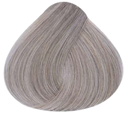
9.8 VERY LIGHT BLONDE PEARL PEARL