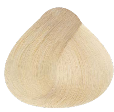
11.00 PLATINUM PLATINUM