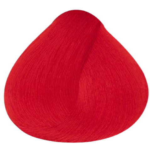
RB RED BOOSTER CORRECTORS- BOOSTER