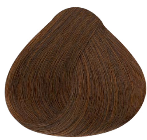
7.45 MEDIUM BLONDE COPPER MAHOGANY BRONZE