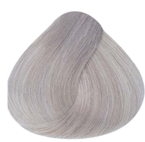
11.80 PLATINUM PEARL PLATINUM