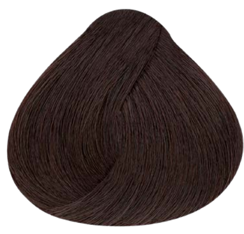
5.35 LIGHT BROWN GOLDEN MAHOGANY GOLDEN MAHOGANY