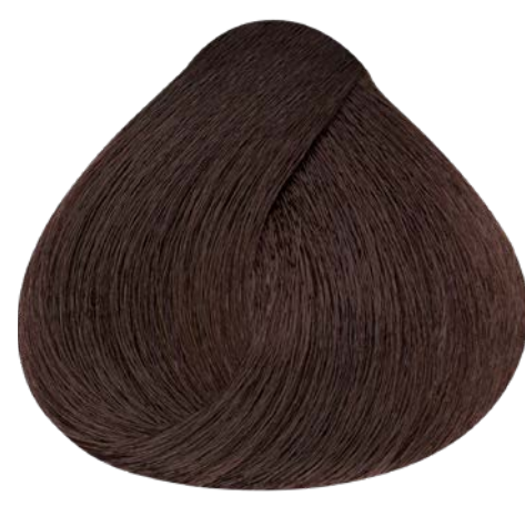
6.35 DARK BLONDE GOLDEN MAHOGANY GOLDEN MAHOGANY