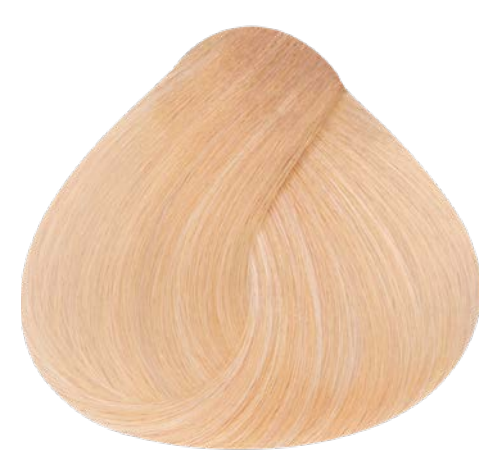
10.342 LIGHTEST BLONDE GOLDEN COPPER VIOLET GOLD