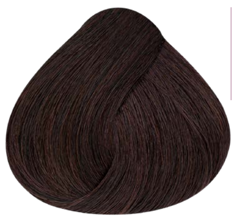
5.53 LIGHT BROWN MAHOGANY GOLD CHOCOLATE