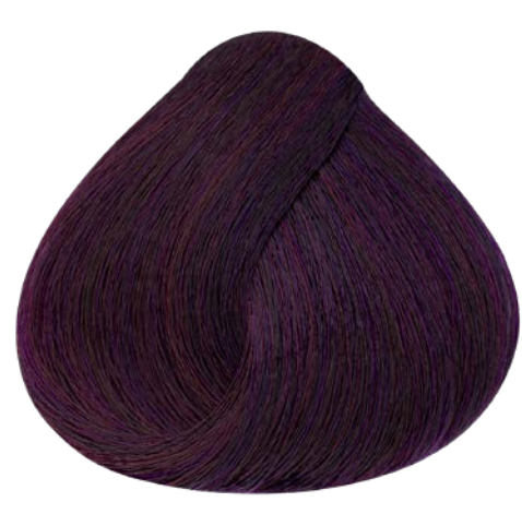
2000 VIOLET CORRECTORS- BOOSTER