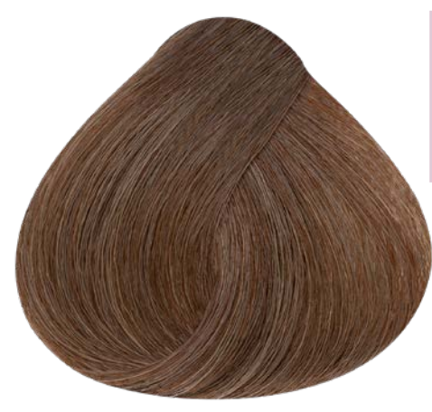
7.32 MEDIUM BLONDE GOLDEN VIOLET CHESTNUT