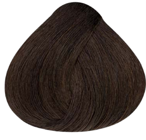
5.32 LIGHT BROWN GOLDEN VIOLET CHESTNUT