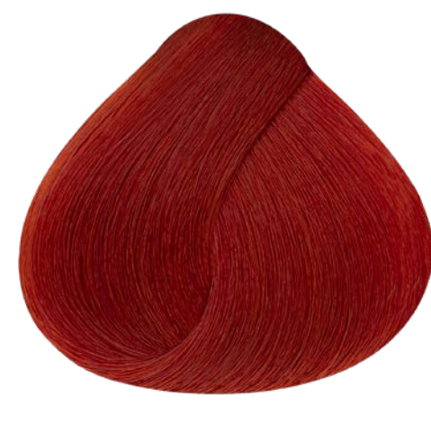
7.66I MEDIUM BLONDE INTENSE RED PURE REDS