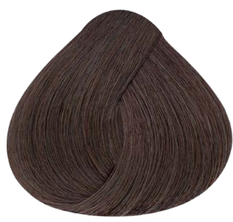
6.15 DARK BLONDE ASH MAHOGANY SUEDES