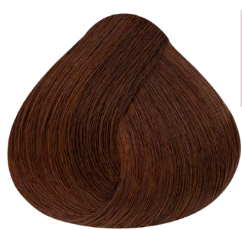
6.4 DARK BLONDE COPPER COPPER