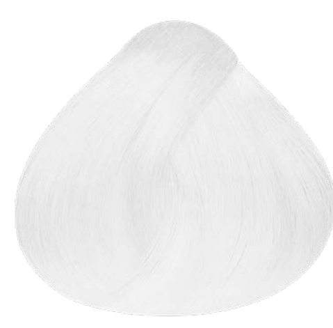
000SSS LIFTING REINFORCER CORRECTORS- BOOSTER