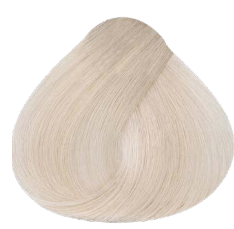
11.02 PLATINUM SOFT VIOLET PLATINUM