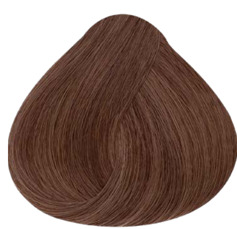
7.24 MEDIUM BLONDE VIOLET COPPER CRYSTAL BROWN