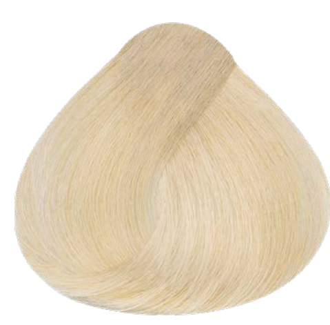
11.13 PLATINUM ASH GOLD PLATINUM