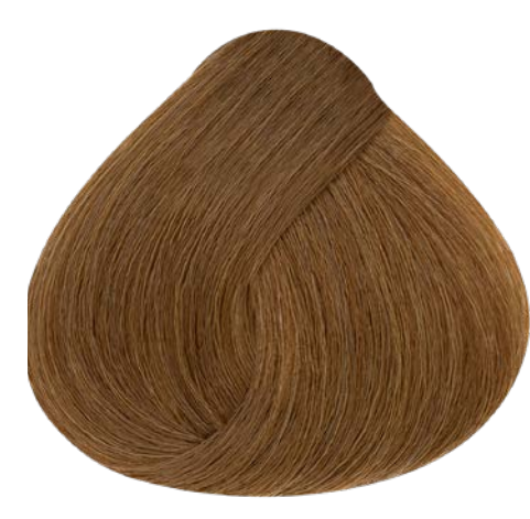
8.3 LIGHT BLONDE GOLD GOLD