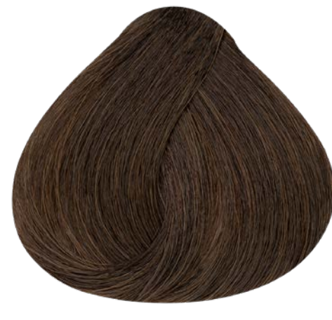
6.32 DARK BLONDE GOLDEN VIOLET CHESTNUT