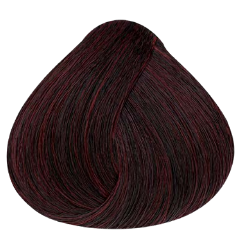
4.65 MEDIUM BROWN RED MAHOGANY REDS