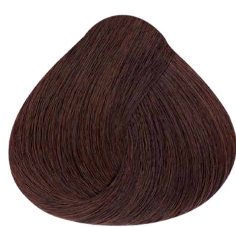
6.5 DARK BLONDE MAHOGANY MAHOGANY