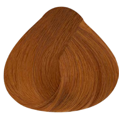
7.43 MEDIUM BLONDE COPPER GOLD EX 7.34 COPPER