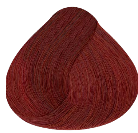
7.6 MEDIUM BLONDE RED COVER REDS