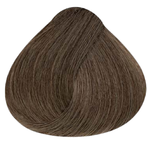
6.23 DARK BLONDE VIOLET GOLD ICED COFFEE