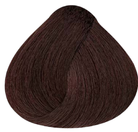
6.53 DARK BLONDE MAHOGANY GOLD CHOCOLATE