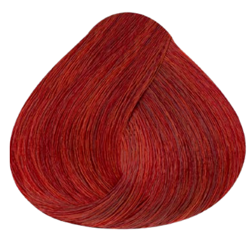
8.66I LIGHT BLONDE INTENSE RED PURE REDS