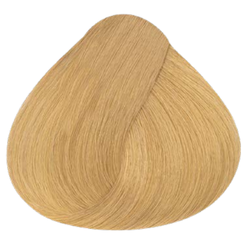
10.3 LIGHTEST BLONDE GOLD GOLD