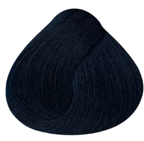
7000 BLUE CORRECTORS- BOOSTER