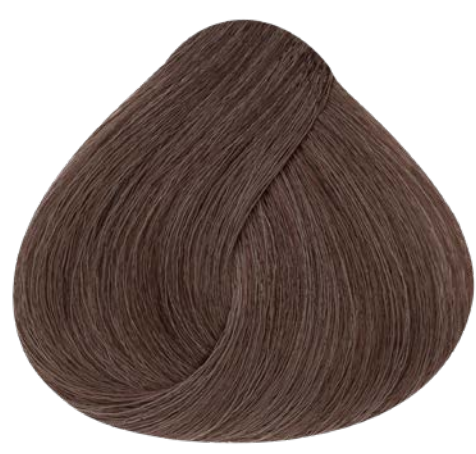
7.51 MEDIUM BLONDE MAHOGANY ASH SUEDES