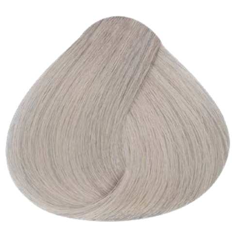
11.11 PLATINUM INTENSE ASH PLATINUM