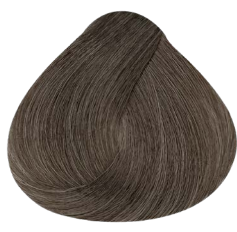
6.7 DARK BLONDE MATTE MATTE