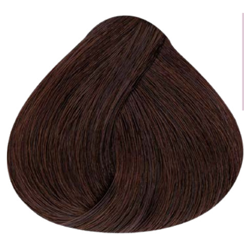
5.5 LIGHT BROWN MAHOGANY MAHOGANY