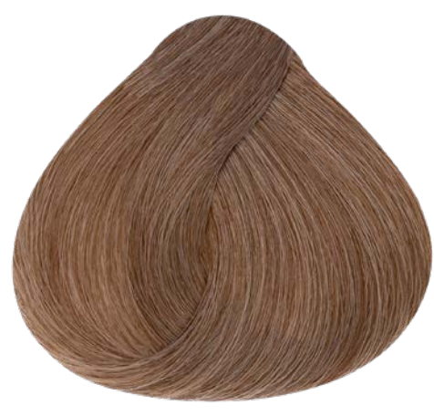
8.32 LIGHT BLONDE GOLDEN VIOLET CHESTNUT