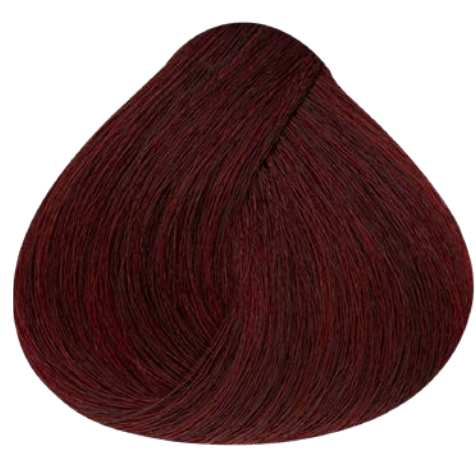
5.6 LIGHT BROWN RED COVER REDS