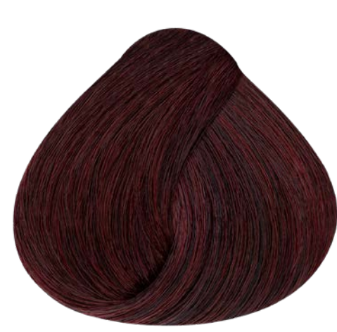
5.65 LIGHT BROWN RED MAHOGANY REDS