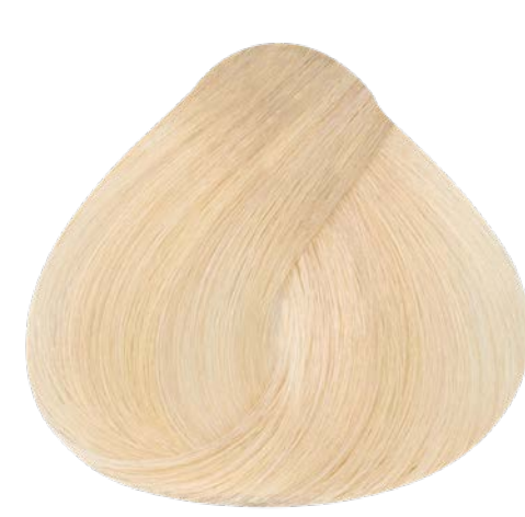
11.32 PLATINUM GOLDEN VIOLET PLATINUM