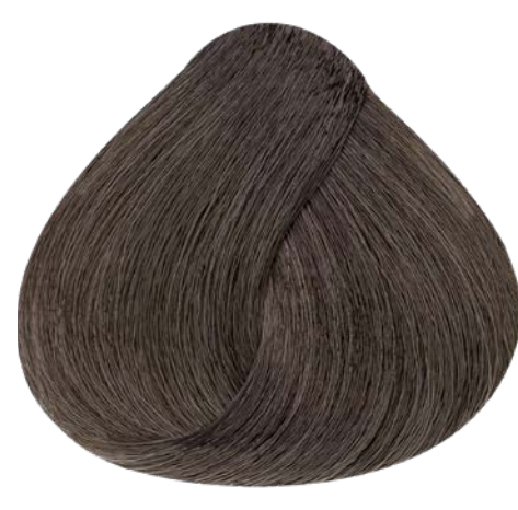
7.8 MEDIUM BLONDE PEARL PEARL