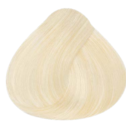
.03 SOFT GOLD HARMONIZER