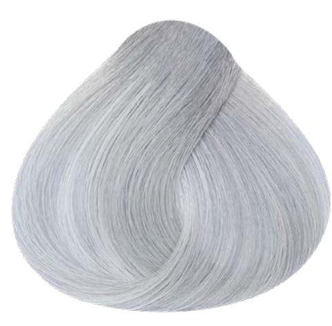
.01 SOFT ASH HARMONIZER