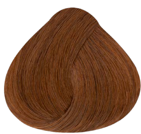
7.4 MEDIUM BLONDE COPPER COPPER