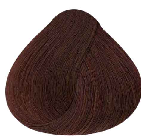
6.562 DARK BLONDE MAHOGANY RED VIOLET MAHOGANY