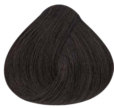
5.75 LIGHT BROWN MATTE MAHOGANY SUEDES