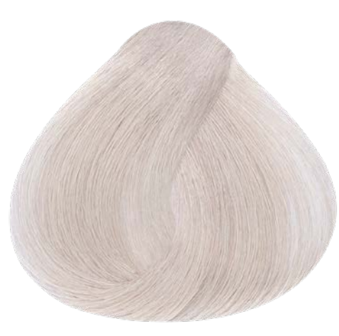
.02 SOFT VIOLET HARMONIZER