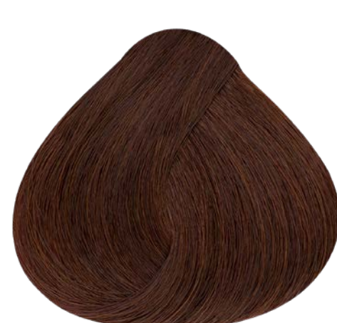
6.45 DARK BLONDE COPPER MAHOGANY BRONZE