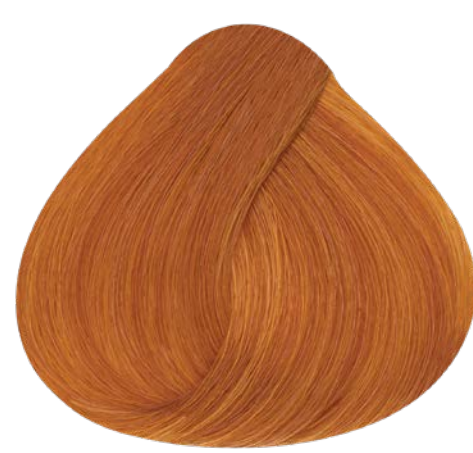
8.34 LIGHT BLONDE GOLD COPPER EX 8.43 COPPER