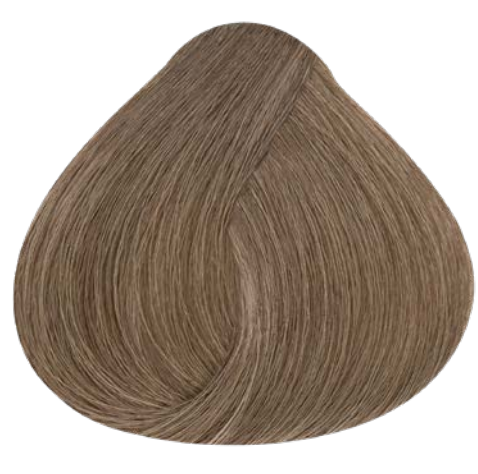
8.13 LIGHT BLONDE ASH GOLD SAND