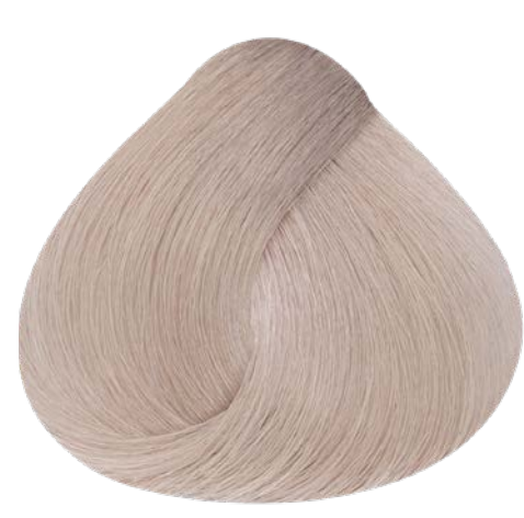
11.20 PLATINUM VIOLET PLATINUM