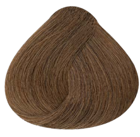
7.31 MEDIUM BLONDE GOLDEN ASH BEIGE