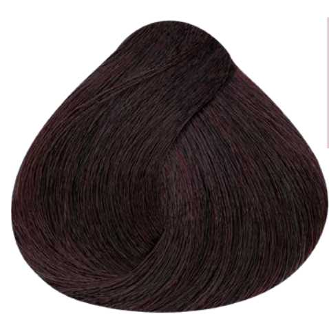
4.52 MEDIUM BROWN MAHOGANY VIOLET MAHOGANY