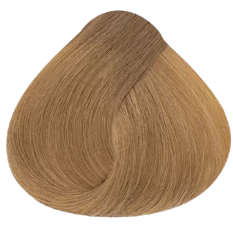
9.31 VERY LIGHT BLONDE GOLDEN ASH BEIGE