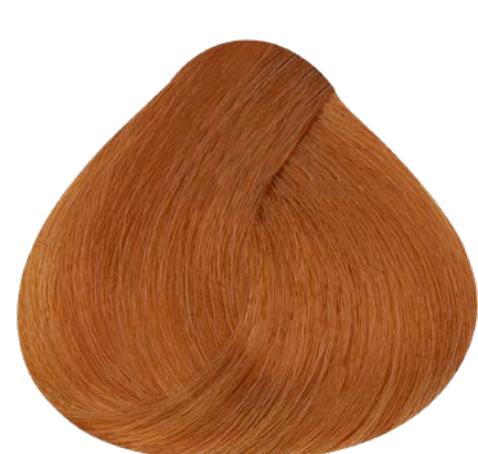
8.4 LIGHT BLONDE COPPER COPPER