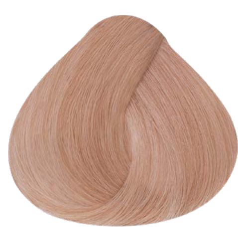
9.45 VERY LIGHT BLONDE COPPER MAHOGANY SUEDES