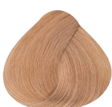
9.04 VERY LIGHT BLONDE SOFT COPPER COPPER