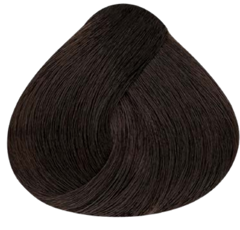
4.32 MEDIUM BROWN GOLDEN VIOLET CHESTNUT