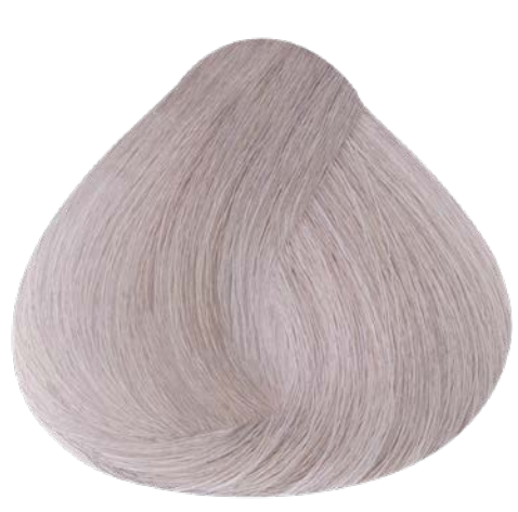
11.21 PLATINUM VIOLET ASH PLATINUM