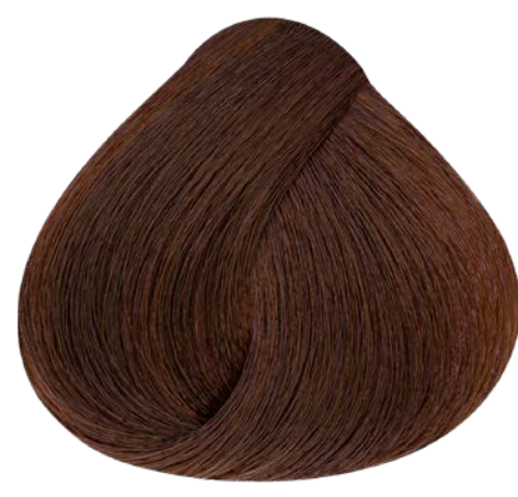
7.53 MEDIUM BLONDE MAHOGANY GOLD CHOCOLATE