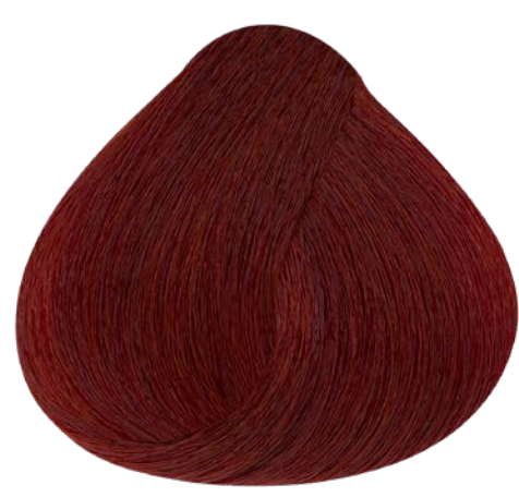
6.6 DARK BLONDE RED COVER REDS