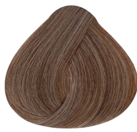
8.05 LIGHT BLONDE SOFT MAHOGANY SUEDES