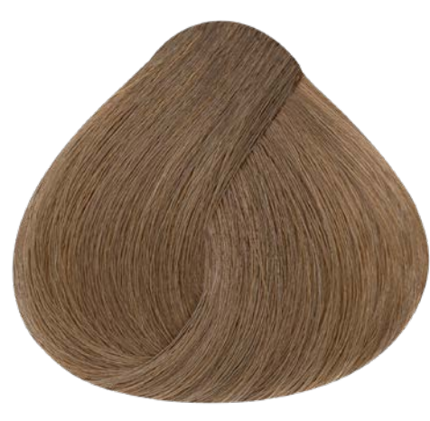
8.23 LIGHT BLONDE VIOLET GOLD ICED COFFEE