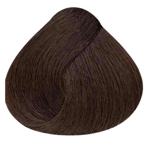
5.3 LIGHT BROWN GOLD GOLD