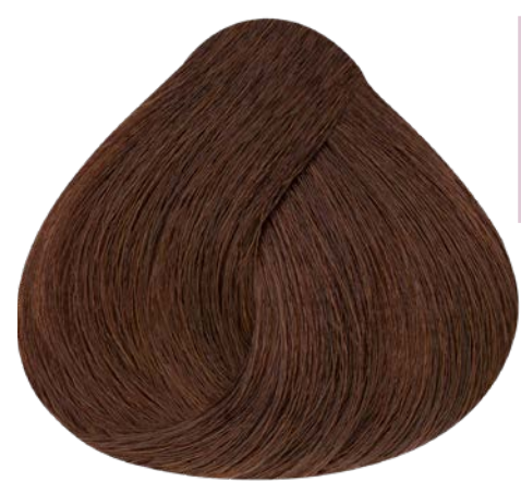
7.35 MEDIUM BLONDE GOLDEN MAHOGANY GOLDEN MAHOGANY