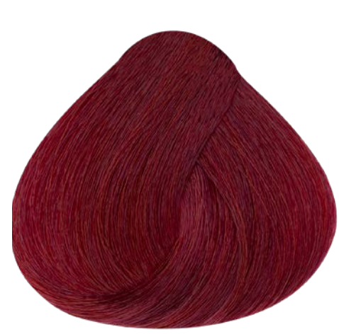
7.62 MEDIUM BLONDE RED VIOLET REDS