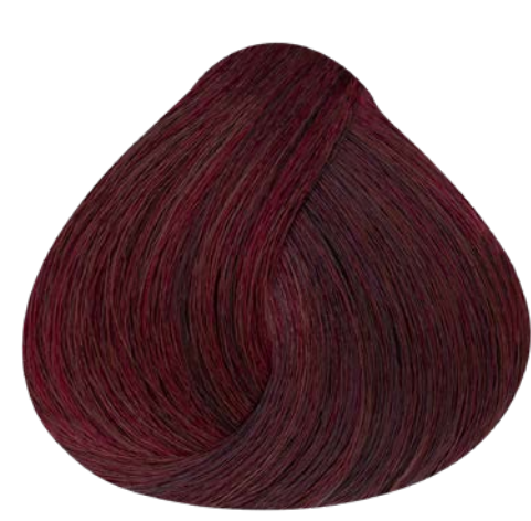
5.62 LIGHT BROWN RED VIOLET REDS