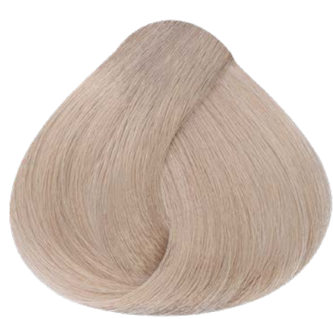
10.05 LIGHTEST BLONDE SOFT MAHOGANY SUEDES