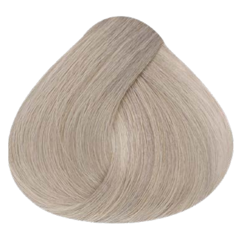
11.10 PLATINUM ASH PLATINUM